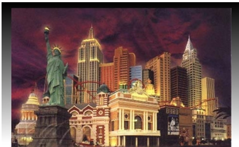
L-45 VEG.45 : New York New York hôtel Casino