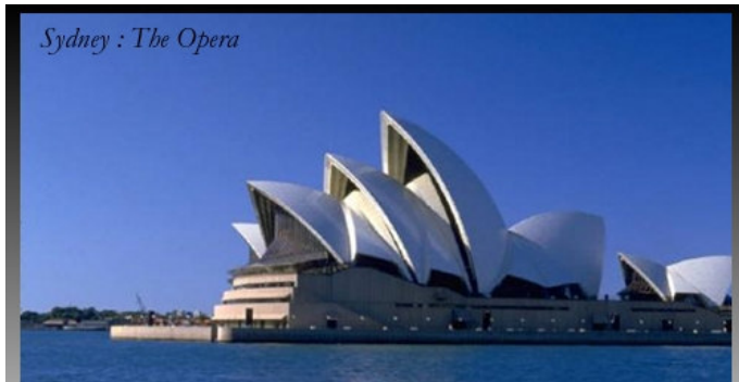
Sydney : The Opera